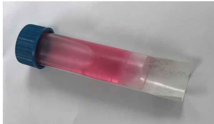
Figure 2: Degraded (Bright Pink)